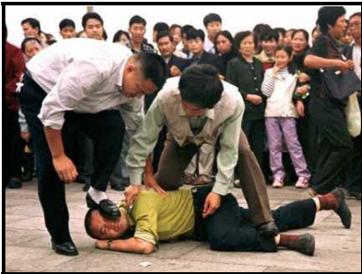
Falun Gong practitioner, brutalised in Tiananmen Square

On October 18, 2002, individual plaintiffs filed a class action lawsuit in the United States District Court against former Chinese leader Jiang Zemin.